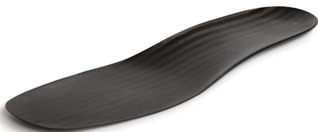
GS PREG footplate

premium quality pre-preg carbon fibre 100%.