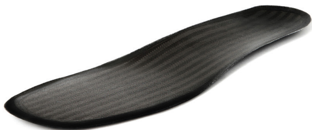
GS PREG footplate Easy Fit

Footplates are available in a right and left. Sold each.