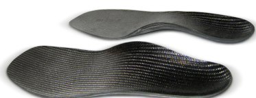
Pre-preg footplate could be manufactured serial as well as custom made.