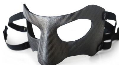
Protective face mask